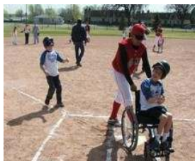
Close play at the plate!

The Little League Challenger division accommodates players with a variety of disabilities, including those with wheelchairs and gives disabled