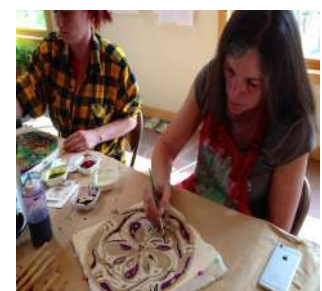
Artonomy –will allow participants to find their inner creative voice.

Additional images can be found on facebook.com/artonomyart I look forward to making art with you.