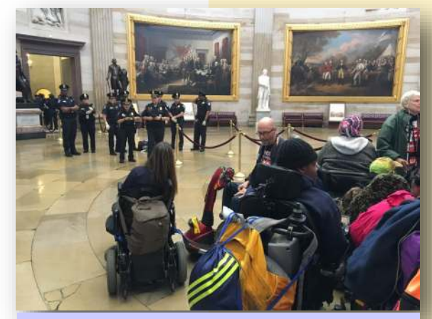
Inside the Capitol Rotunda, advocates meeting D.C. Police

.I traveled with disability advocates to Washington DC on March 22<sup>nd</sup> and 23<sup>rd</sup> to share our concerns about the Ameri-