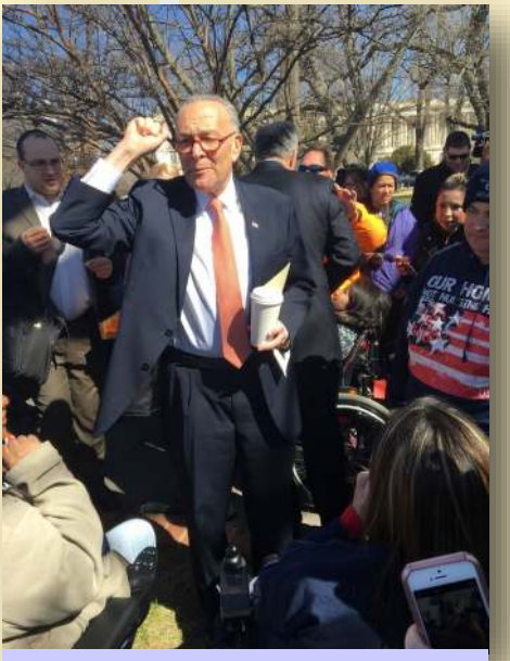
We ran into Senator Schumer (D-NY)

sending mixed messages on whether they will take another run at healthcare anytime soon. That said I would encourage everyone to stay vigilant and to