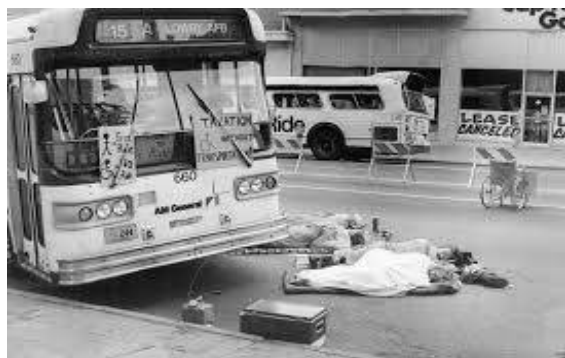
Disability-Rights Activists Protest in Denver

There is no single person responsible for the passage of the ADA, but rather a collection of actions that helped propel this law to the forefront. As the civil rights movement of the 60s and 70s changed America, more voices were being heard establishing disability rights as basic human rights. Disability activist groups were formed across the country. One action initiated in Colorado were the remarkable efforts of the Gang of 19. The Gang of 19 (with assistance from PASCO founder Barry Rosenberg) demanded that people with disabilities have the same level of access to public transportation as able-bodied individuals. In July of 1978, 19 brave individuals Rolled their wheelchairs into a