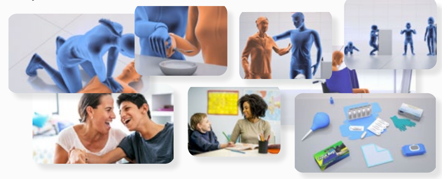
For more information, please visit: https://pascohh.com/caregiver-training-center/

Our Caregiver Training Center is a great resource for caregivers, family members of individuals with disabilities, or for those just looking to learn something new. Our step-by-step videos and written guides are a helpful tool for learning a completely new skill or can be a refresher for the skills you already know and utilize.